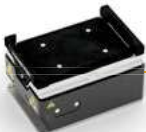
Hamilton Heater Shaker